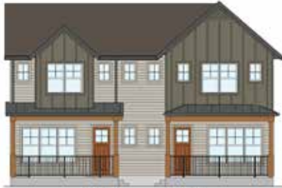
SCHEME 2 UNIT B / UNIT A | 5805 / 5807