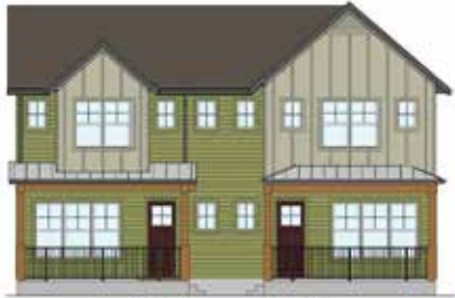
SCHEME 1 UNIT B / UNIT A | 6010 / 6008