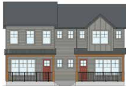
SCHEME 7 – FLIPPED UNIT C / UNIT B | 6105 / 6107