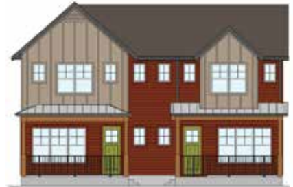
SCHEME 3 - FLIPPED UNIT A / UNIT B | 5900 / 5812