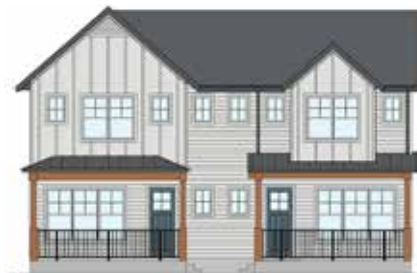
SCHEME 8 - FLIPPED UNIT A / UNIT B | 6108 / 6106