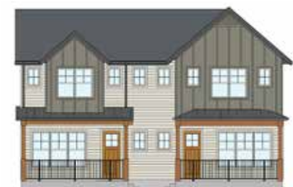
SCHEME 6 UNIT B / UNIT A | 5912 / 5910