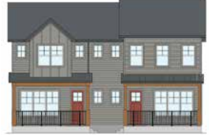
SCHEME 7 UNIT B / UNIT C | 5806 / 5804