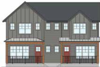
SCHEME 7 - FLIPPED UNIT A / UNIT B | 5903 / 5905