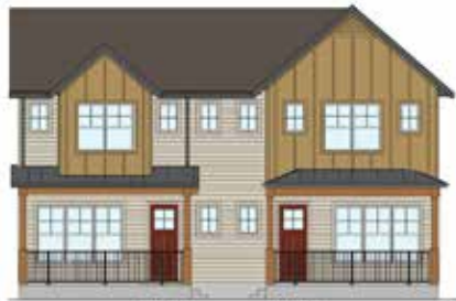
SCHEME 4 UNIT B / UNIT A | 6101 / 6103