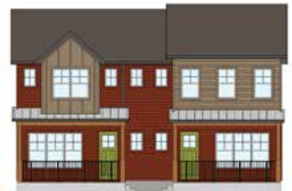
SCHEME 3 UNIT B / UNIT C | 6006 / 6004