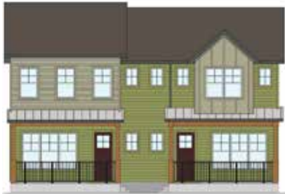
SCHEME 1 – FLIPPED UNIT C / UNIT B | 5809 / 5811, 6112 / 6110