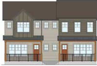
SCHEME 2 UNIT B / UNIT C | 6100 / 6012