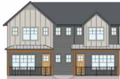
SCHEME 5 - FLIPPED UNIT A / UNIT B | 6003 / 6005