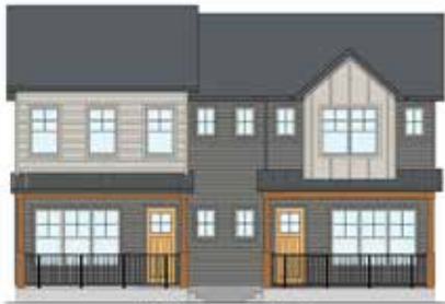
SCHEME 5 – FLIPPED UNIT C / UNIT B | 5907 / 5909