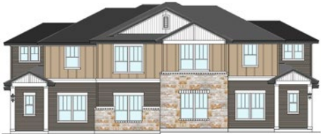
UNIT B TYPE 4 - ELEVATION A UNIT A ELEVATION A3