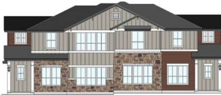
UNIT B TYPE 4 - ELEVATION C UNIT A ELEVATION C2