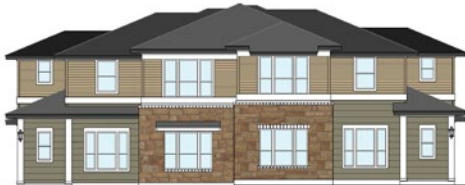
UNIT B TYPE 4 - ELEVATION B UNIT A ELEVATION B1