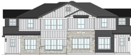
UNIT B TYPE 4 - ELEVATION C UNIT A ELEVATION C3