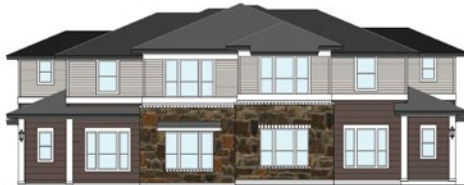
UNIT B TYPE 4 - ELEVATION B UNIT A ELEVATION B2