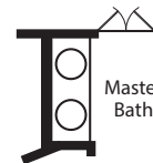
Double Sink at Master Bath Option